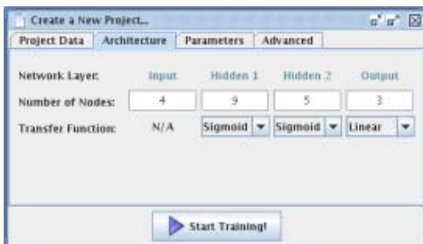
Creating a new project during initialization

The Initialization Mode allows the user to configure neural networks using any number of inputs and output nodes, along with zero to two hidden layers.